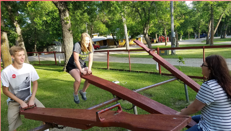
Some fun after a hard day's work!