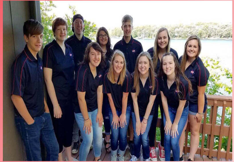
The 2016 - 2017 NLAB